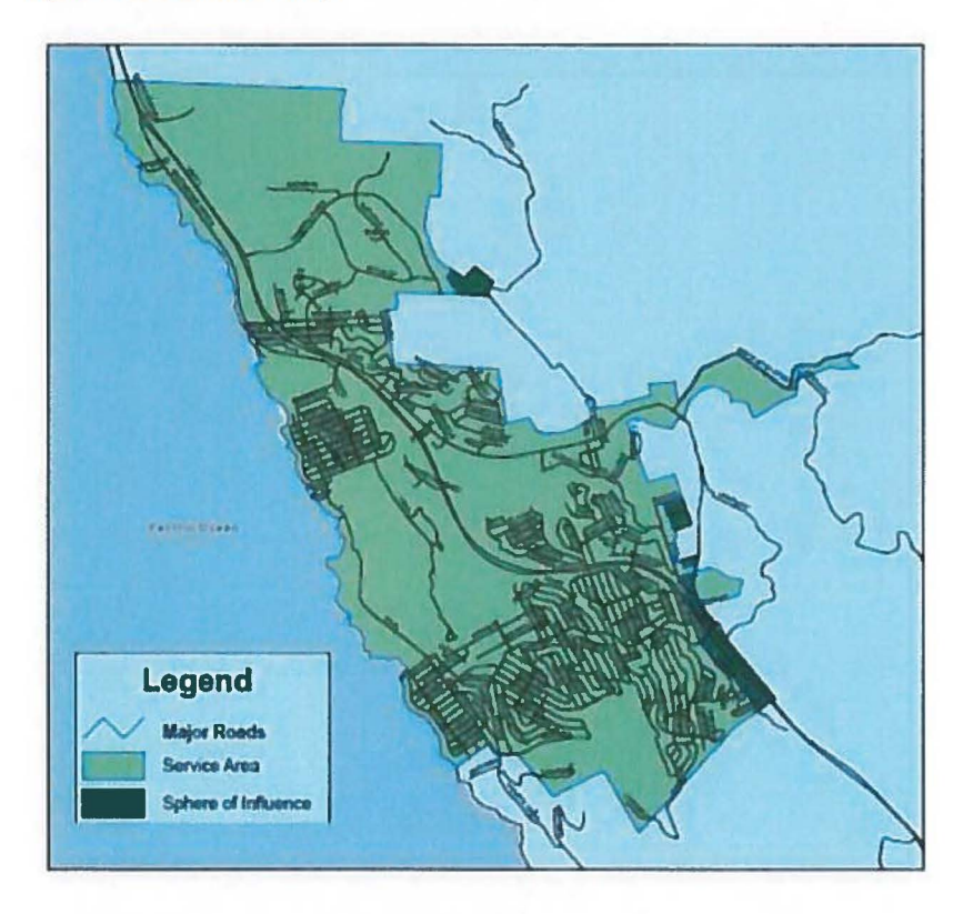
Figure 2 CCSD Service Area and Sphere of Influence Area